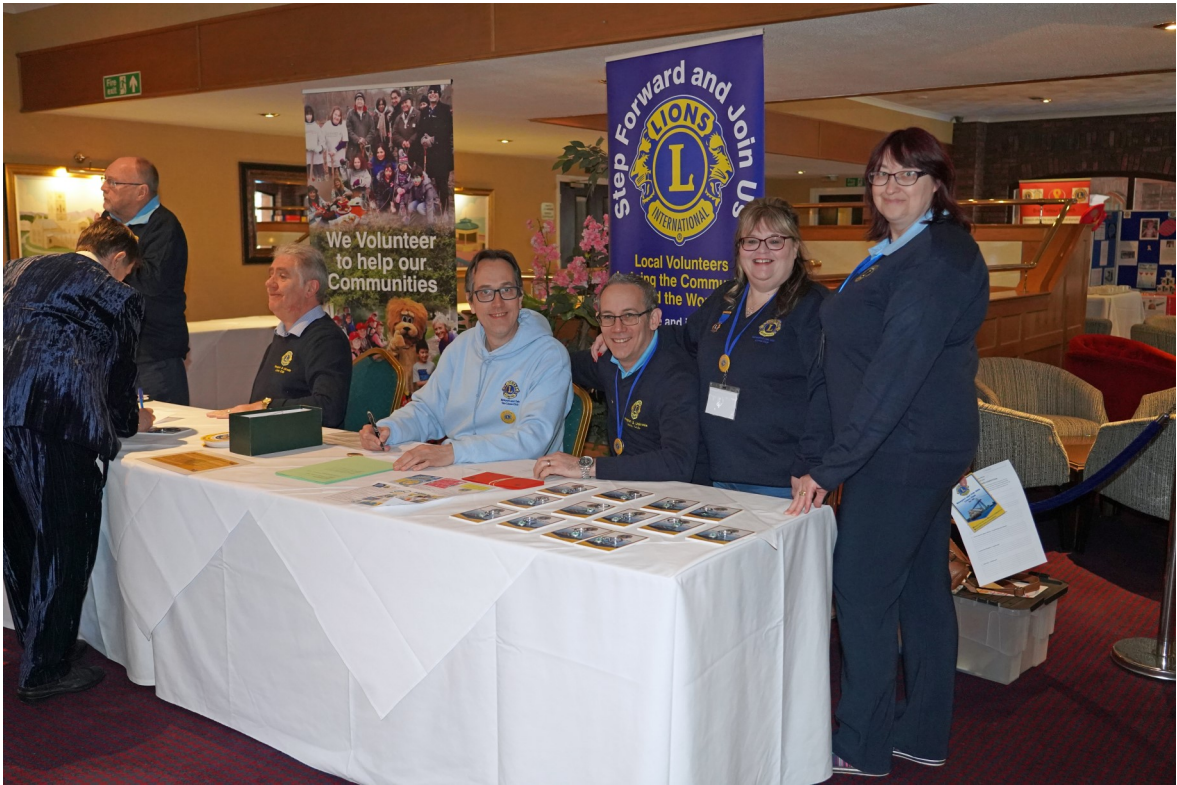
Newport and Usk Valley Lions host Convention Committee