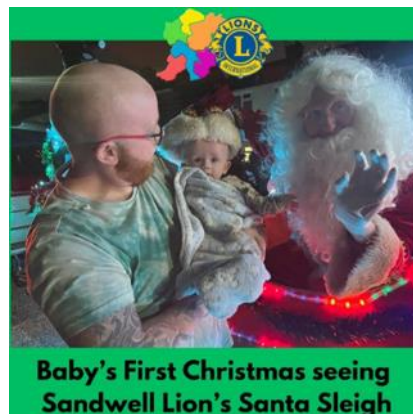
Baby's First Christmas seeing Sandwell Lion's Santa Sleigh

We have also bought items and compiled and delivered Christmas Packs to the Sandwell Homeless and Resettlement Project.