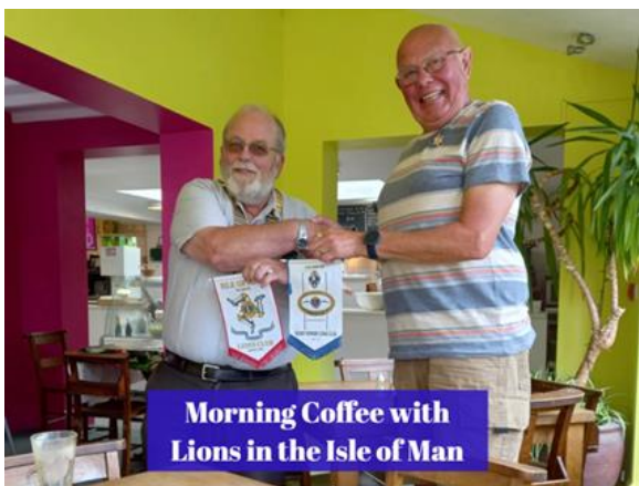
Morning Coffee with Lions in the Isle of Man