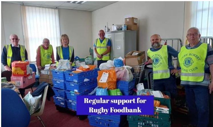
Regular support for Rugby Foodbank

They say a picture paints a thousand words so, rather than writing a huge amount, here's a picture gallery of just a few of our recent events and service . . .