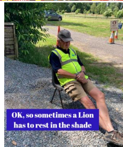
OK, so sometimes a Lion has to rest in the shade