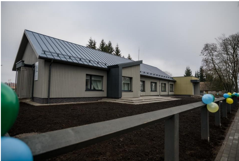
Construction of an orphanage in Lithuania with the help from clubs from Nothern Germany, LCIF and NSL. A project by 111NB, Germany.