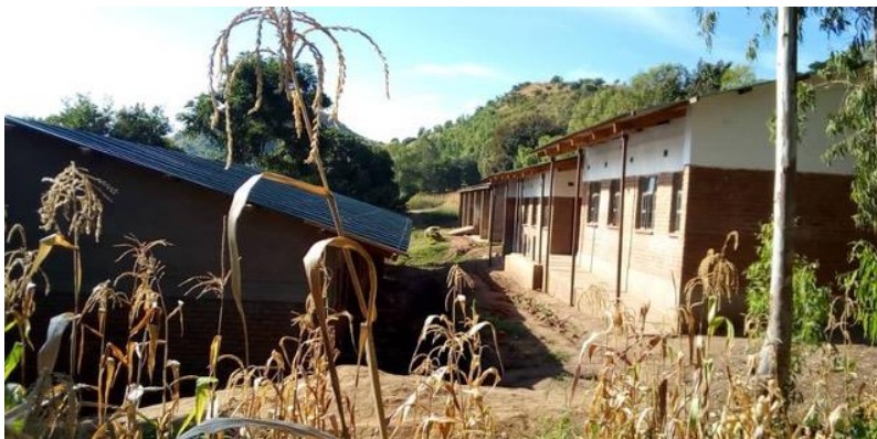
Construction of a secondary school in Malawi. A project by 110CW – Netherland.