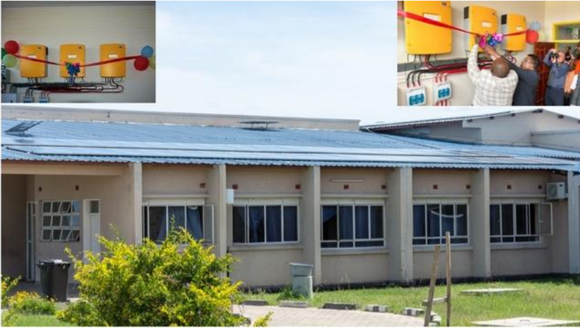
Solar panels for a hospital in Zambia. A project by 110BN – Netherland.